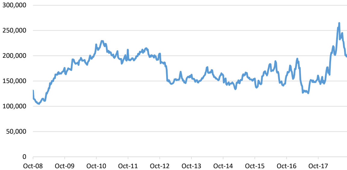
Index Trader Gross Long Position - Live Cattle